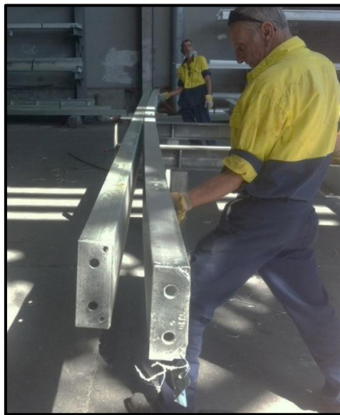
Two identical fabricated PFC sections galvanised at the same time with vastly different deformation

This report will present the reasons deformation occurs, how often galvanizers are experiencing it and the mitigative processes put in place to minimise the effects of the deformation.