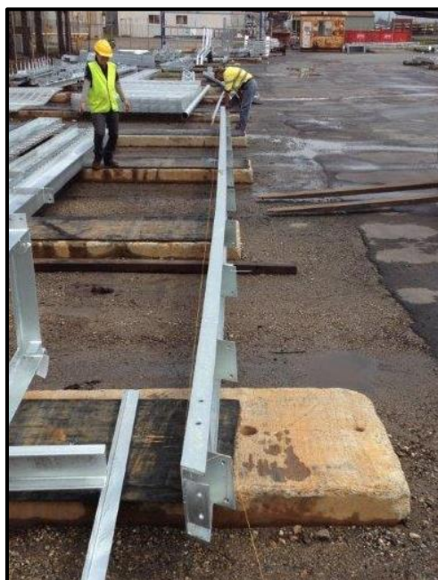
A fabricated PFC that has distorted during the galvanizing process

A galvanizer also mentioned the inclusion of hollow sections welded to PFC with inadequate draining and venting holes result in longer emersion times also increasing the likelihood of distortion.