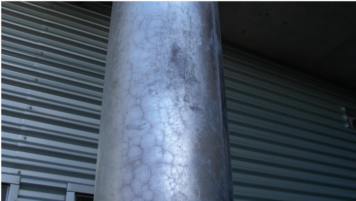
Figure 3: Mottled appearance on a pipe, most likely due to the steel chemistry.