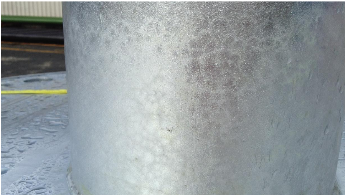
Figure 4: The scale like mottled appearance evident on a circular article.