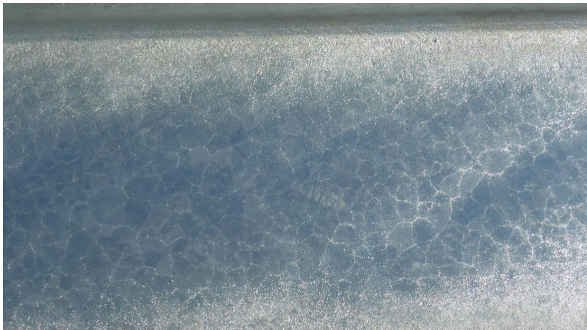
Figure 2: A close up of a mottled appearance, showing the difference between the shiny and dull regions.